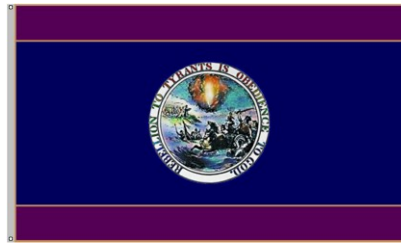
New Flag for The United States of America