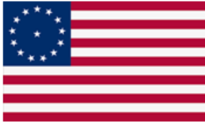
Old Confederation flag