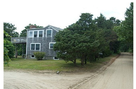
Dike House along Dike Road is 150 yards from the bridge.