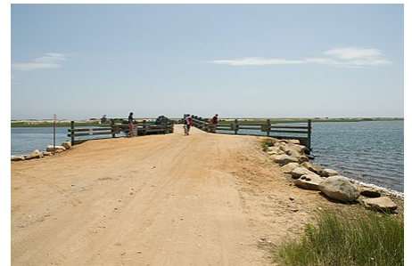
The Dike Bridge is accessible only by a dirt road, and leads to dead-end sand dunes past Poucha Pond. The guardrail was not present in 1969.