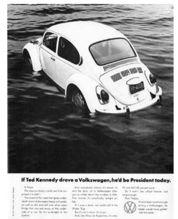
National Lampoon fake VW Beetle ad mocking the incident. Visit Print Magazine [102] for a higher-resolution image where the ad copy is legible