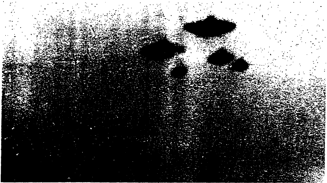
Sheffield, England, 4 March 1962