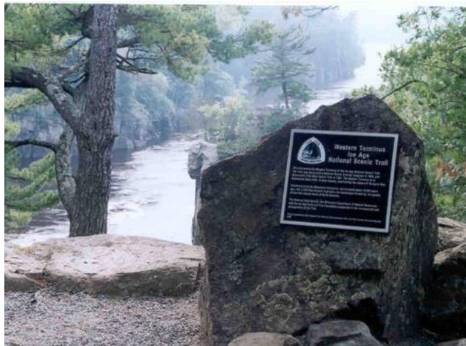
Scenic view of glacial features at the western terminus of Ice Age NST in Wisconsin.

The National Trails System (NTS) is a nationwide network of national scenic trails (NSTs), national historic trails (NHTs), and national recreation trails (NRTs). Of the 32 Congressionally designated national scenic and historic trails, the NPS administers or co-administers 25 trails. In 2023, the existing Ice Age, New England, and North Country national scenic trails were administratively designated as units of the National Park System, joining three other national scenic trails.