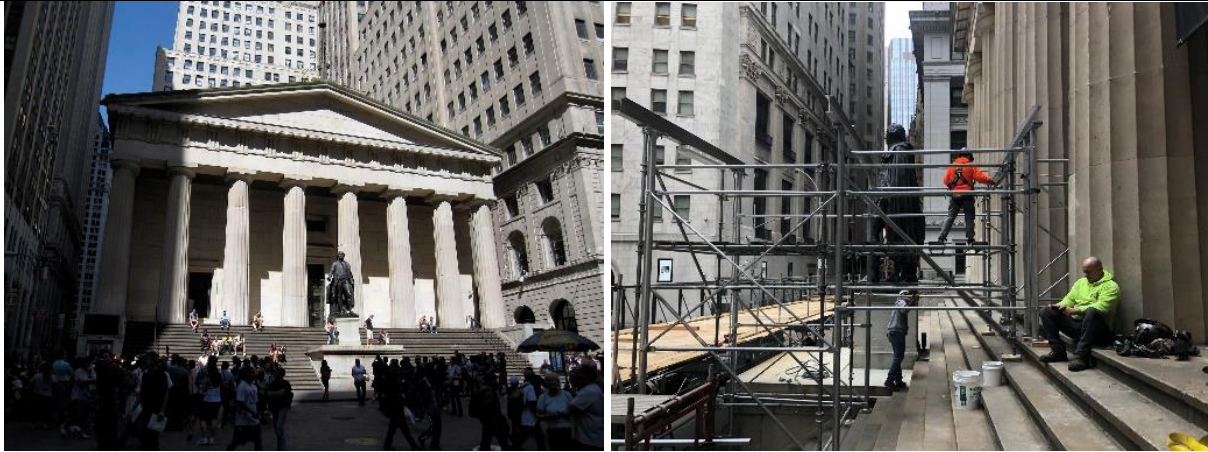
Left: Exterior of Federal Hall