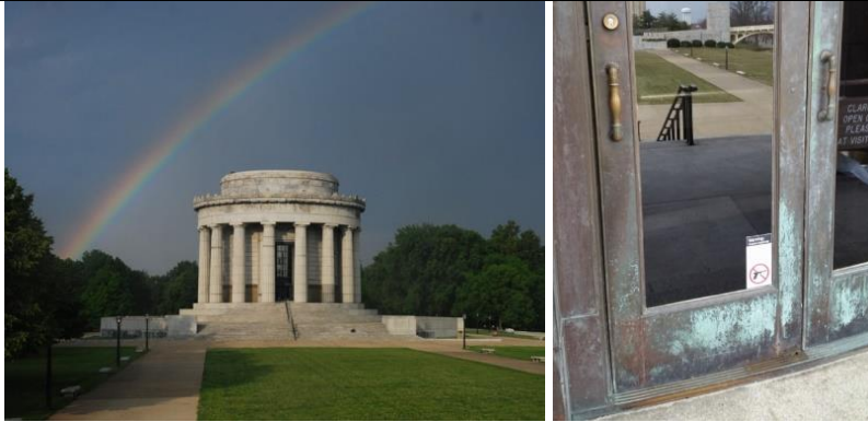
Left: Memorial Building

Location: George Rogers Clark National Historical Park, Indiana