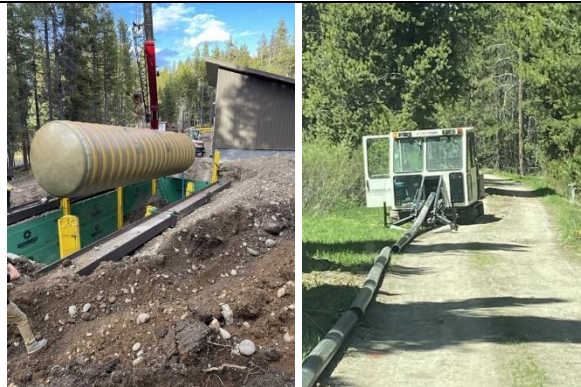
Left: Replacement surge tank adjacent to lift station

Location: Grand Teton National Park, Wyoming