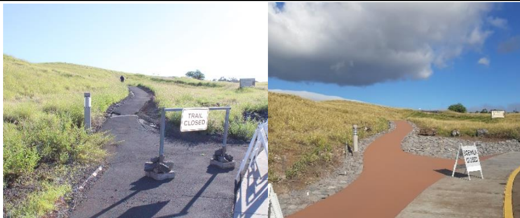
Left: The deteriorated, narrow, and uneven trail surface. Right: The rehabilitated trail, with smooth, even, and renewed surface.

Projects like this one at Puukohola Heiau National Historical Park, to re-design and repair a pedestrian trail from the Visitor Center to the Headquarters facility are funded through the Repair and Rehabilitation program. The project repaired and restored a vital visitor use connection at the visitor center where public restrooms and interpretive programs are provided. The trail is now erosion resistant and protects existing sewer and fiber optic utilities running beneath the trail.