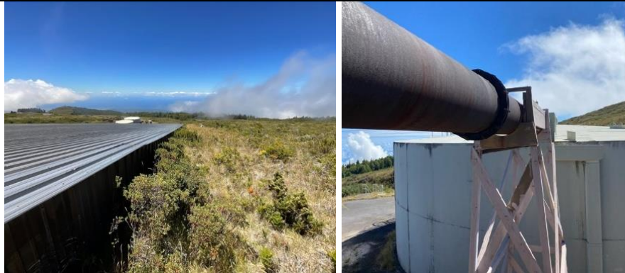
Left: Rain Catchment Structure

Location: Haleakalā National Park, Hawai'i