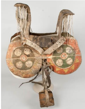
Buffalo Country Saddle from the Wetxuuwi'itin Collection

Online features about NPS museum collections offer a deeper connection into the stories behind collections. In FY 2023, the NPS launched a website to showcase the Nez Perce Tribe: Wetxuuwi'itin Collection and celebrate the 25 th anniversary of the return of the collection to the Nez Perce Tribe.