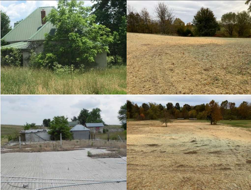
Top and bottom left: overgrown, dilapidated buildings that are not needed for park operations. Top and bottom right: clear field with replanted native plants on the site of the overgrown buildings following demolition.

Projects like this one at Wilson’s Creek National Battlefield, to remove 16 incidentally acquired structures, are funded through the Demolition and Disposal program. The structures were removed, and the land restored, enabling the park to open the area for interpretation to the public.