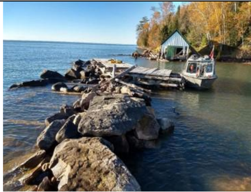
Left: Wave action at Little Sand Bay Marina Right: Storm damage at Devils Island Marina

This $17.2 million project will rehabilitate and stabilize the marina waterfront systems at Little Sand Bay and Devils Island. It will reinforce the seawall and wooden cribbing to reduce exterior wave overtopping and interior wave height. Work at Devils Island will also include reconstruction of the boat house using salvaged materials.