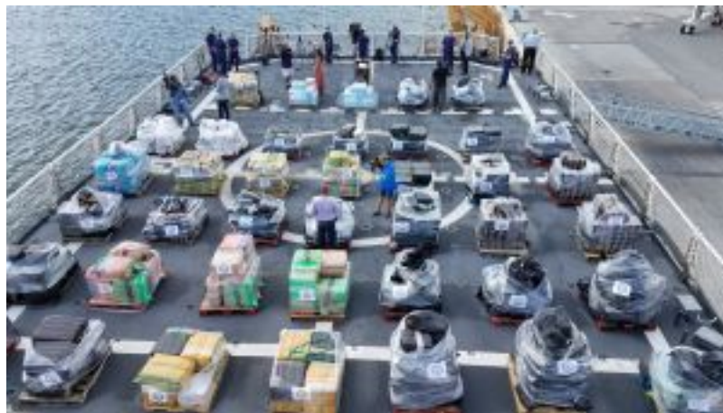
Figure 6: Pallets containing approximately 18.5 tons of seized cocaine.

“The 18.5 tons of seized cocaine coming off our decks today is the product of partnerships and the collaboration of U.S. Southern Command, Joint Interagency Task Force-South, the Departments of Homeland Security, Defense, State and Justice, the Canadian Navy and many of our international maritime service partners,” said Capt. Scott Clendenin, commanding officer of Coast Guard Cutter Hamilton. “Our efforts to interdict modern maritime smugglers involves intricately choreographed actions of joint, interagency and international operations centers, aircraft and vessels operating in concert against stealthy and well-funded international criminal smuggling organizations.”